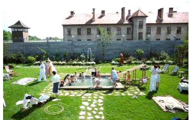
The Zone of Interest

This film is a bold, surgical probe into our capacity for zoning out on genocide and is very chilling. Rudolf Höss and his family live a pastoral idyll, with a lovely home and rose filled garden, but the backdrop is a high wall with chimneys beyond from which come persistent but indistinguishable sounds which even birdsong cannot hide.