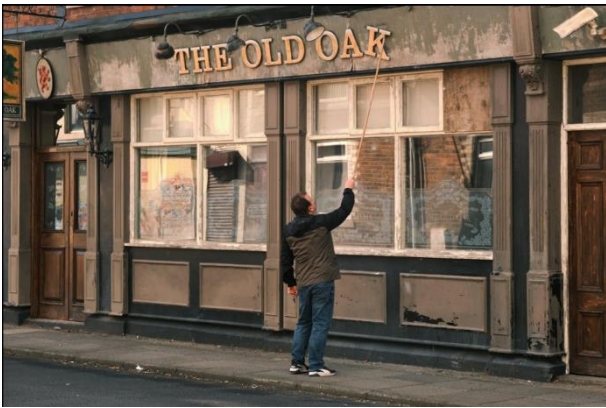
The Old Oak