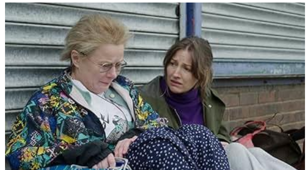
Typist, Artist, Pirate, King